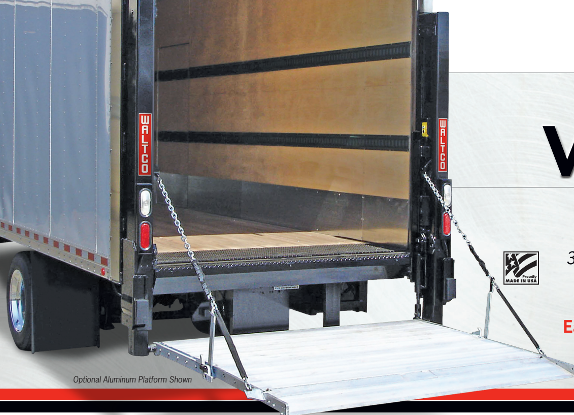
Optional Aluminum Platform Shown