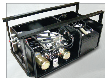
Dual Pump and Motor on 5,500 lb. and 6,600 lb. models with simple toggle to backup

Products shown may feature optional equipment. Content subject to change without notice.