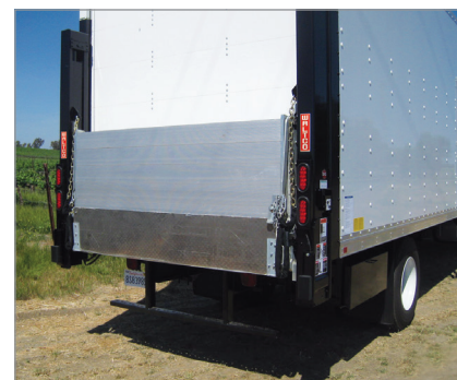
WDV Series Gate in stowed position offers simplicity and reduced maintenance

The WDV offers extra advantages for your delivery solution.