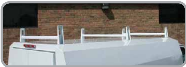
Optional Overhead Ladder Rack