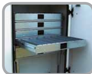
Optional Drawer Packages