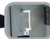
Standard Bar Locks