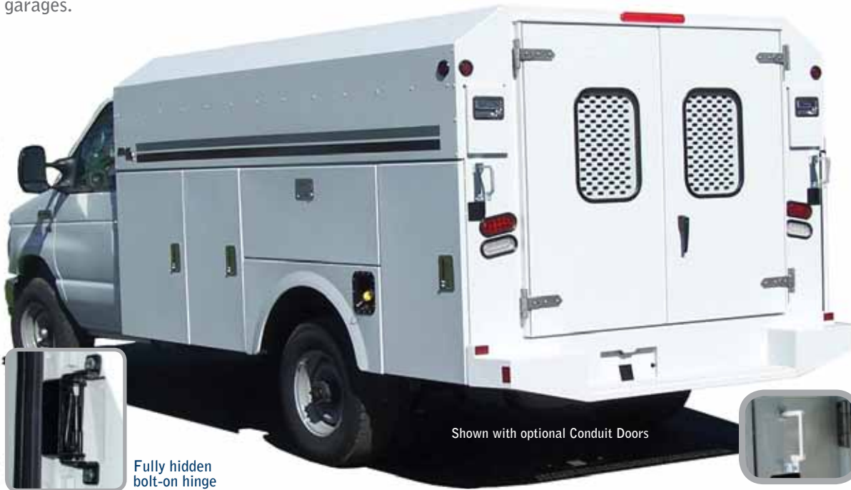
Shown with optional Conduit Doors

Hidden door hinges provide security while their bolt-on design makes them maintenance-friendly