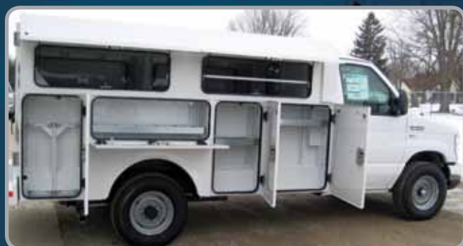
Optional Flip-Up Side Access Doors allow access to load space shelving

Covered by a 5-Year "No Rust, No Bust" warranty