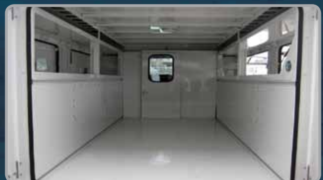
Large interior load space provides plenty of secured storage