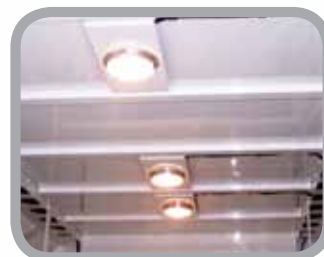
Optional Dome Lights