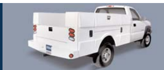
GCX Service Body