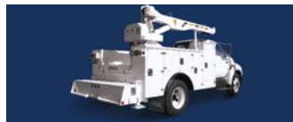
Crane & Heavy-Duty Body & STAHL® Crane