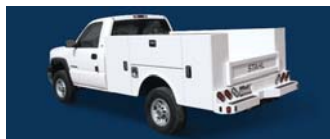
Challenger X Service Body