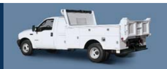
Challenger Dump Body