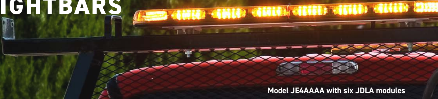
Model JE4AAA with six JDLA modules